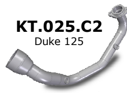
KT.025.C2 Duke 125