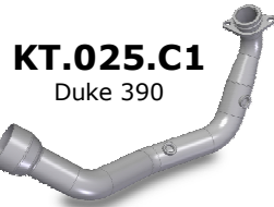
KT.025.C1 Duke 390

Tubo no kat - No kat pipe Monta sia con silenziatori MIVV che con lo scarico originale It fits both MIVV and genuine silencer